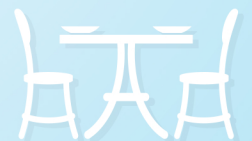
TABLE NOT READY MORE THAN 15 MINUTES PAST RESERVATION TIME