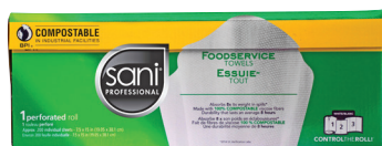
Dry Foodservice Towels 200-CT. (G125DA)