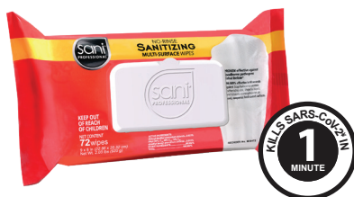
No-Rinse Sanitizing Multi-Surface Wipes 72-CT. (M30472)