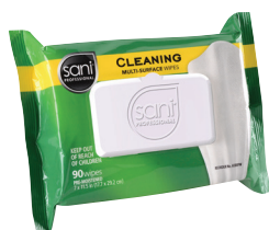
Cleaning Multi-Surface Wipes 90-CT. (A580FW)