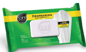
Degreasing Multi-Surface Wipes 75-CT. (A12345)