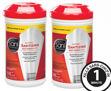
No-Rinse Sanitizing Multi-Surface Wipes 175-CT. (P66784), 95-CT. (P56784)